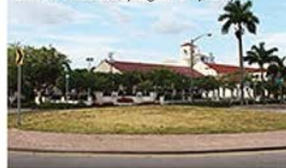
Segovia at Biltmore Way (which has been barren of landscaping for 2+ years)

Isn't it time to go back to the days of open, participative government with a warm, embracing administration where citizens can be heard?