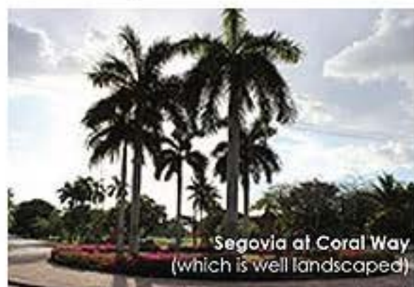
Segovia at Coral Way (which is well landscaped)

T he recent departure of our last city manager hopefully heralds the end of an autocratic style of government which minimized the flow of information and marginalized the input of citizens. While optimistically wishing that I am correct, I am concerned. In the City's "E-News" of May 7, there is another "announcement" about expensive public art pieces being planned for the two "Segovia Circles" at Biltmore Way and Coral Way.